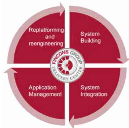
Fincons Group Smart-Shore

The Delivery Center's offering, combined with the Group's expertise, represents a true excellence hub that links business know-how with innovation, efficiency and the ability to offer IT services across different technology platforms and vertical solutions of leader software vendors.